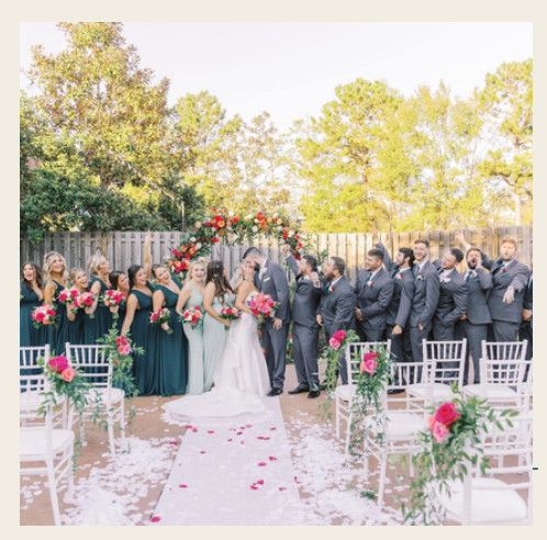
MULTIPLE CEREMONY LOCATIONS AVAILABLE